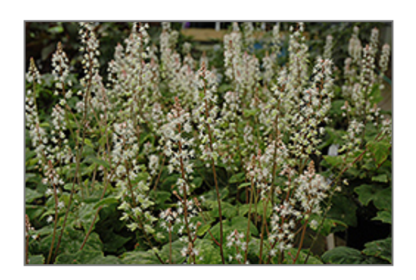
Wherry's Foamflower flowers

Plant Height: 6 inches Flower Height: 12 inches Spread: 12 inches Spacing: 10 inches Sunlight: • • Hardiness Zone: 3a