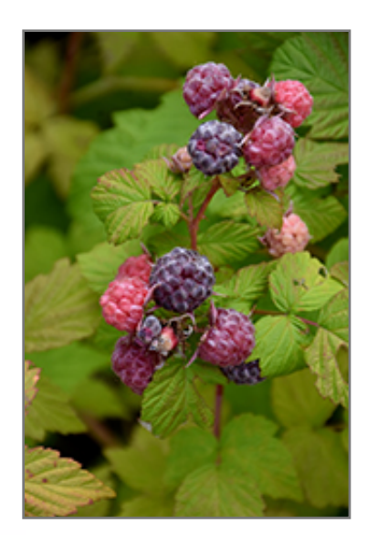
Jewel Black Raspberry fruit

A relatively disease-resistant variety of black raspberry producing firm, glossy and flavorful fruit in summer; raspberries are quite shrubby looking and require careful placement in the landscape, a specific pruning regimen and protection from birds