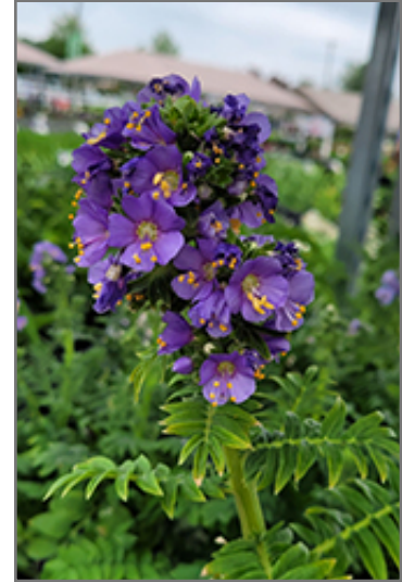
Heavenly Habit Jacob's Ladder flowers

Heavenly Habit Jacob's Ladder has masses of beautiful spikes of lightly-scented lilac purple star-shaped flowers with white eyes and yellow anthers rising above the foliage from mid spring to mid summer, which are most effective when planted in groupings. The flowers are excellent for cutting. Its ferny pinnately compound leaves remain dark green in colour throughout the season.