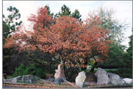
Allegheny Serviceberry in fall

This tree does best in full sun to partial shade. It prefers to grow in average to moist conditions, and shouldn't be allowed to dry out. It is not particular as to soil type or pH. It is somewhat tolerant of urban pollution. This species is native to parts of North America.