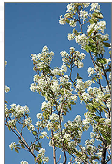
Allegheny Serviceberry flowers