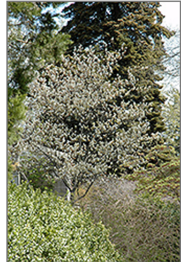
Allegheny Serviceberry in bloom

Allegheny Serviceberry is recommended for the following landscape applications;