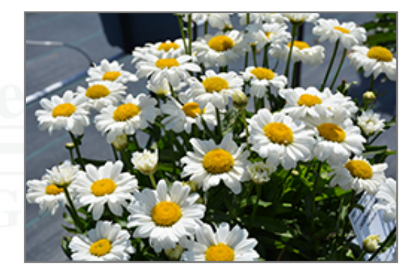
Sweet Daisy Jane Shasta Daisy flowers