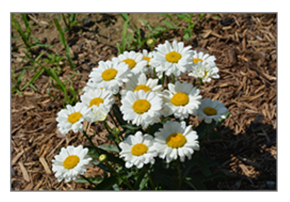
Sweet Daisy Jane Shasta Daisy in bloom

This plant will require occasional maintenance and upkeep. Trim off the flower heads after they fade and die to encourage more blooms late into the season. It is a good choice for attracting butterflies to your yard. Gardeners should be aware of the following characteristic(s) that may warrant special consideration;