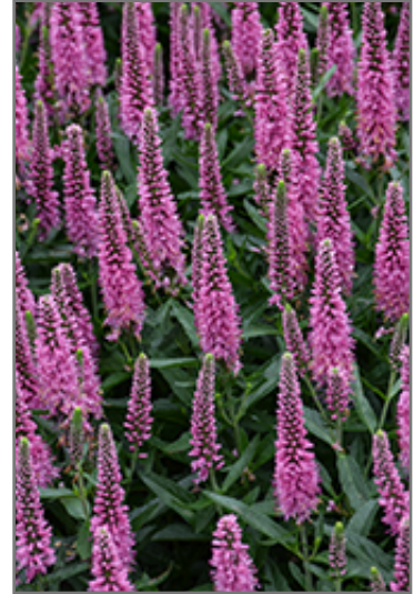
Skyward Pink Long-leaf Speedwell flowers

Skyward Pink Long-leaf Speedwell is recommended for the following landscape applications;