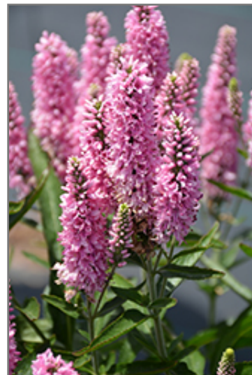
Skyward Pink Long-leaf Speedwell flowers

Skyward Pink Long-leaf Speedwell will grow to be about 14 inches tall at maturity, with a spread of 16 inches. When grown in masses or used as a bedding plant, individual plants should be spaced approximately 16 inches apart. Its foliage tends to remain dense right to the ground, not requiring facer plants in front. It grows at a medium rate, and under ideal conditions can be expected to live for approximately 8 years. As an herbaceous perennial, this plant will usually die back to the crown each winter, and will regrow from the base each spring. Be careful not to disturb the crown in late winter when it may not be readily seen!