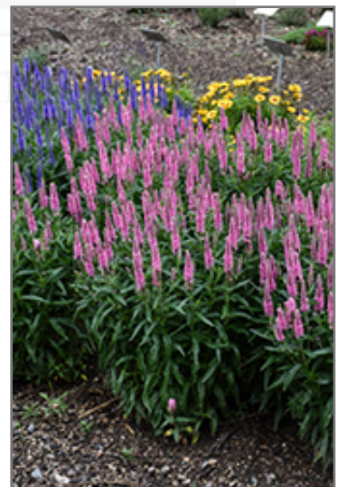
Skyward Pink Long-leaf Speedwell in bloom