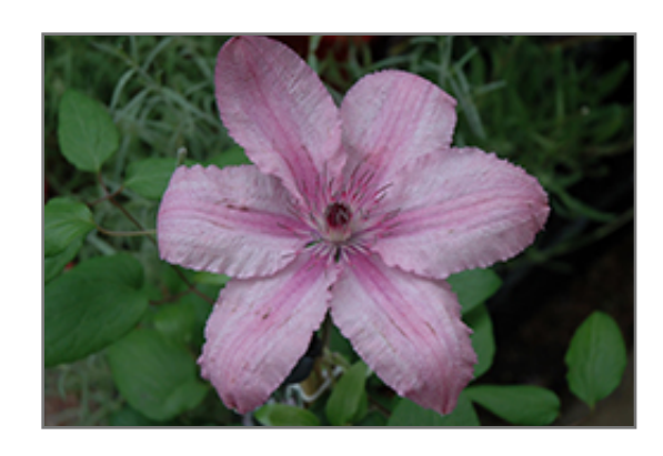
Hagley Hybrid Clematis flowers

A popular hybrid clematis featuring showy medium-sized light pink flowers in abundance throughout the summer, a wonderful choice for covering a fence or climbing up an arbor