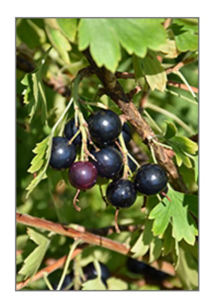
Crandall Clove Currant fruit