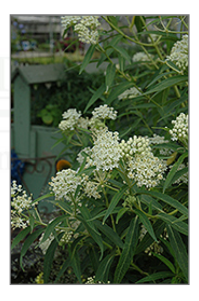
Ice Ballet Milkweed flowers