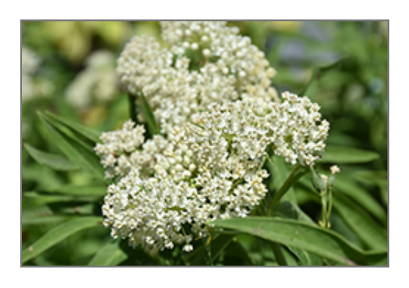
Ice Ballet Milkweed flowers

This is a relatively low maintenance plant, and is best cleaned up in early spring before it resumes active growth for the season. It is a good choice for attracting butterflies to your yard, but is not particularly attractive to deer who tend to leave it alone in favor of tastier treats. It has no significant negative characteristics.