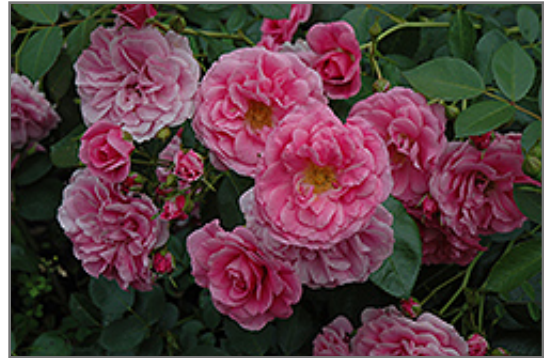
Felix Leclerc Rose flowers

Felix Leclerc Rose is recommended for the following landscape applications;