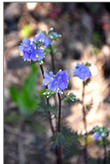
Purple Rain Jacob's Ladder flowers

This dark variety presents an attractive mound of deep bronze-purple, lacy foliage on dark red stems; large, blue flowers rise up in early to mid-summer; looks great in the middle to front of the border and easily mixes with other plants