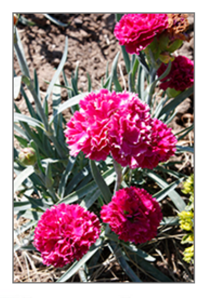
Fruit Punch Funky Fuchsia Pinks flowers

Heavily ruffled, fully double flowers are vibrant fuchsia, above mounds of silver blue foliage; great for flower arrangements; deadhead to rebloom; pair up with summer blooming perennials and annuals to time a continued flower display