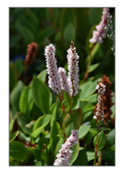
Dimity Dwarf Fleeceflower flowers

This variety forms a spreading mat of deep green, leathery leaves that turn bronze-red in fall; short spikes of deep red flowers appear in summer, fading to soft pink; an excellent groundcover that tolerates light foot traffic