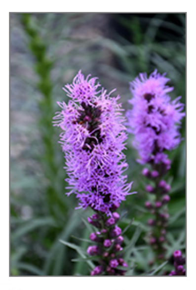
Blazing Star flowers

This plant will require occasional maintenance and upkeep, and is best cleaned up in early spring before it resumes active growth for the season. It is a good choice for attracting butterflies to your yard, but is not particularly attractive to deer who tend to leave it alone in favor of tastier treats. Gardeners should be aware of the following characteristic(s) that may warrant special consideration;