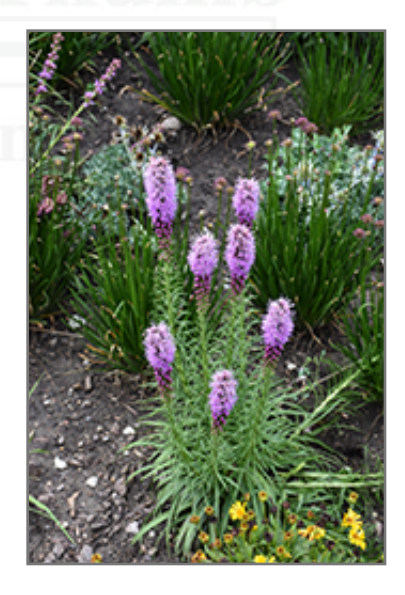
Blazing Star in bloom