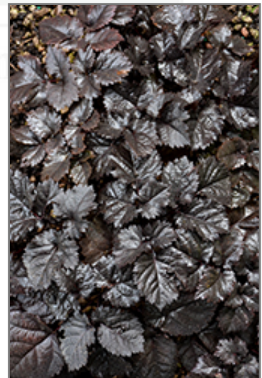
Dark Side Of The Moon Astilbe foliage