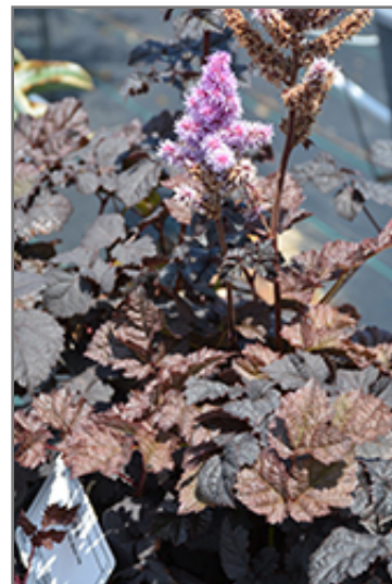
Dark Side Of The Moon Astilbe in bloom

Dark Side Of The Moon Astilbe is a fine choice for the garden, but it is also a good selection for planting in outdoor pots and containers. With its upright habit of growth, it is best suited for use as a 'thriller' in the 'spiller-thriller-filler' container combination; plant it near the center of the pot, surrounded by smaller plants and those that spill over the edges. Note that when growing plants in outdoor containers and baskets, they may require more frequent waterings than they would in the yard or garden. Be aware that in our climate, most plants cannot be expected to survive the winter if left in containers outdoors, and this plant is no exception. Contact our experts for more information on how to protect it over the winter months.