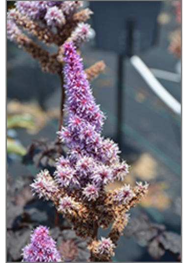
Dark Side Of The Moon Astilbe flowers

Dark Side Of The Moon Astilbe is an herbaceous perennial with an upright spreading habit of growth. Its relatively fine texture sets it apart from other garden plants with less refined foliage.