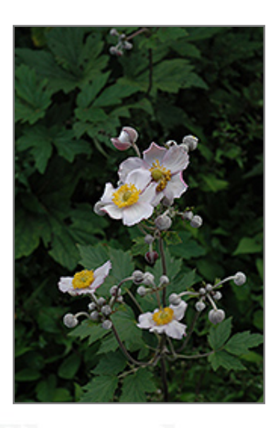
Grapeleaf Anemone flowers