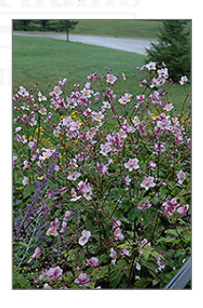
Grapeleaf Anemone flowers