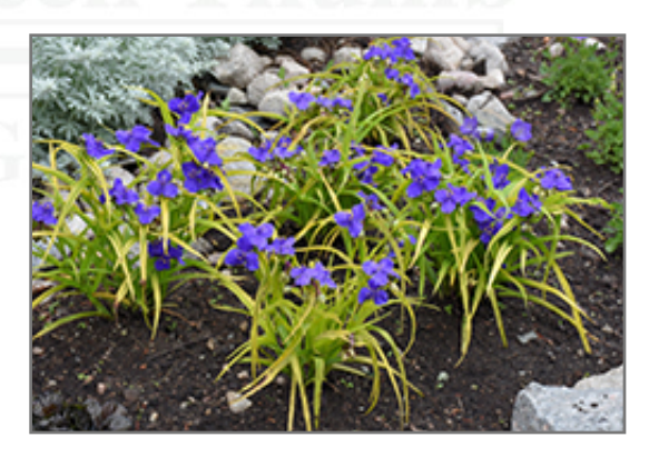
Sweet Kate Spiderwort in bloom