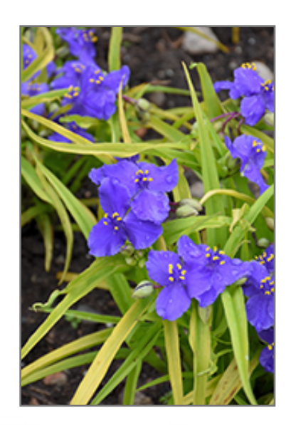
Sweet Kate Spiderwort flowers

Sweet Kate Spiderwort is recommended for the following landscape applications;