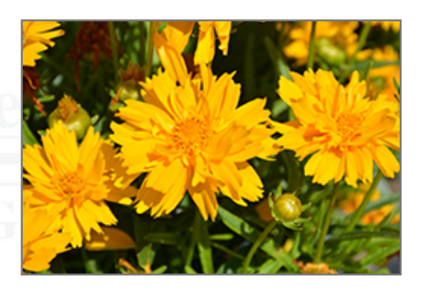
Double the Sun Tickseed flowers

This is a relatively low maintenance plant, and is best cleaned up in early spring before it resumes active growth for the season. It is a good choice for attracting butterflies to your yard, but is not particularly attractive to deer who tend to leave it alone in favor of tastier treats. It has no significant negative characteristics.