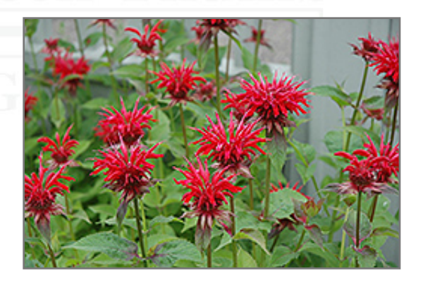
Jacob Cline Beebalm flowers