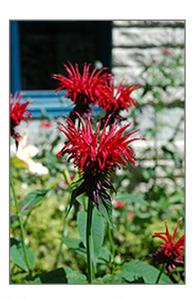
Jacob Cline Beebalm flowers