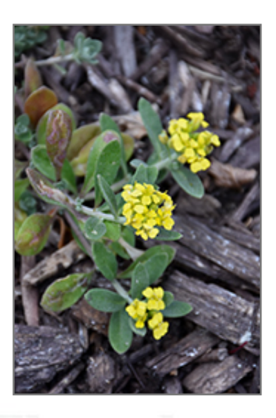
Mountain Gold Alyssum flowers

This is a relatively low maintenance plant, and should be cut back in late fall in preparation for winter. It is a good choice for attracting bees and butterflies to your yard, but is not particularly attractive to deer who tend to leave it alone in favor of tastier treats. It has no significant negative characteristics.