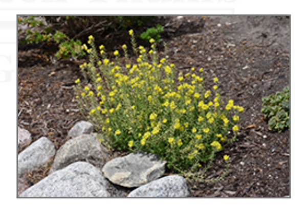
Mountain Gold Alyssum in bloom