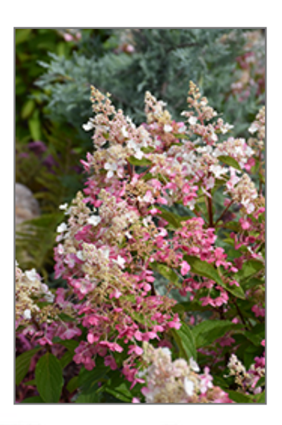
Pinky Winky Hydrangea (tree form) flowers

Pinky Winky Hydrangea (tree form) features bold conical white flowers at the ends of the branches from mid summer to late fall. The flowers are excellent for cutting. It has green deciduous foliage. The pointy leaves do not develop any appreciable fall colour.