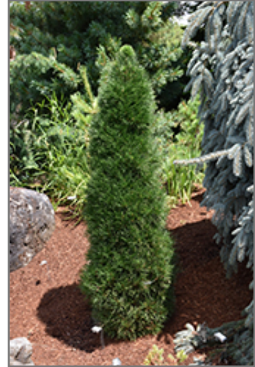
Green Penguin Scotch Pine

Green Penguin Scotch Pine is recommended for the following landscape applications;