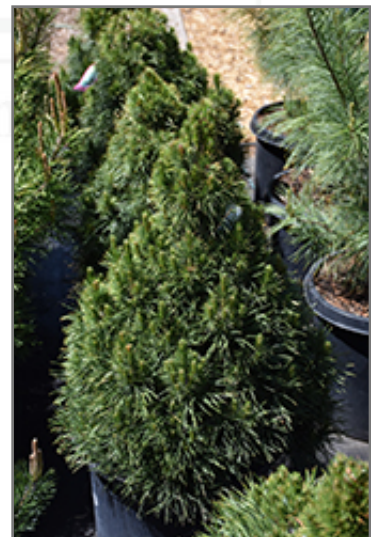
Green Penguin Scotch Pine