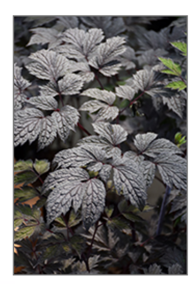
Chocoholic Bugbane foliage

Chocoholic Bugbane is recommended for the following landscape applications;