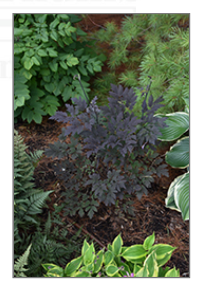
Chocoholic Bugbane