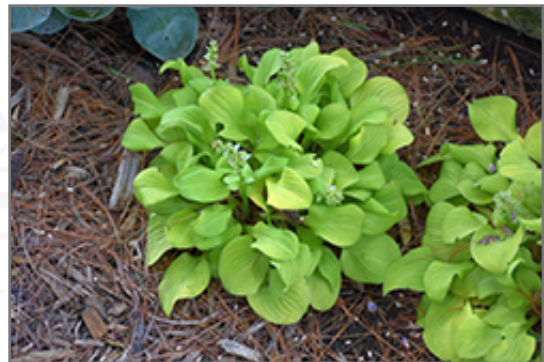
Sun Mouse Hosta