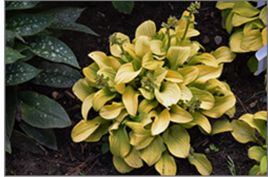
Sun Mouse Hosta