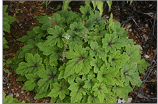
Fingerprint Foamflower

Fingerprint Foamflower is an herbaceous evergreen perennial with tall flower stalks held atop a low mound of foliage. Its medium texture blends into the garden, but can always be balanced by a couple of finer or coarser plants for an effective composition.