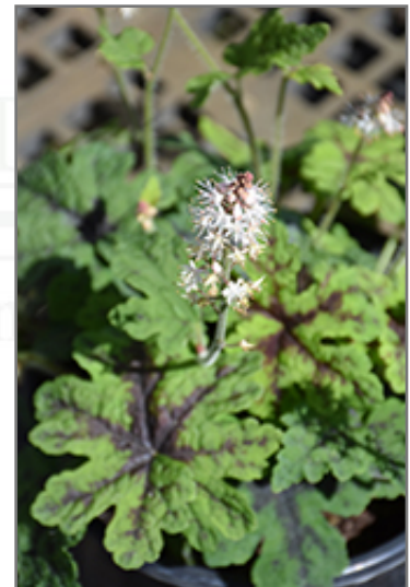
Fingerprint Foamflower flowers