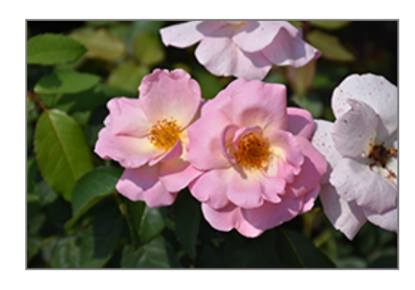
Peachy Knock Out Rose flowers

Peachy Knock Out Rose is draped in stunning fragrant shell pink flowers with yellow eyes at the ends of the branches from late spring to mid fall. The flowers are excellent for cutting. It has dark green deciduous foliage. The glossy oval compound leaves do not develop any appreciable fall colour. The fruits are showy red hips displayed in late fall.