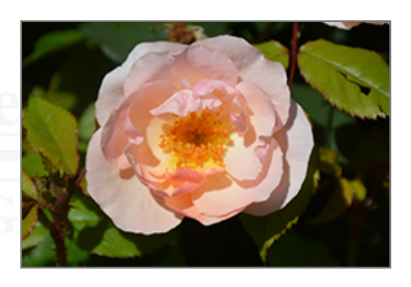
Peachy Knock Out Rose flowers