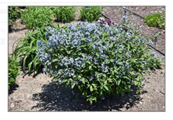
Storm Cloud Bluestar in bloom