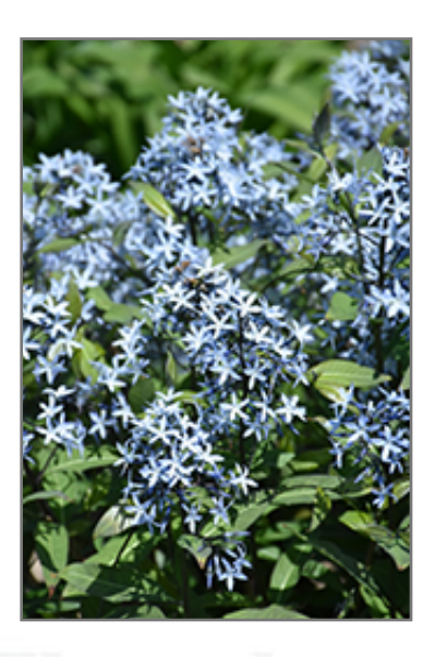
Storm Cloud Bluestar flowers

Storm Cloud Bluestar is an herbaceous perennial with a more or less rounded form. Its medium texture blends into the garden, but can always be balanced by a couple of finer or coarser plants for an effective composition.