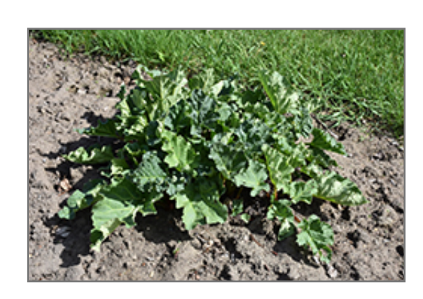
Victoria Rhubarb

Long thick dark red leaf stems have a sweet and juicy flavor with very tender skin and flesh texture without the stringiness like most other rhubarb; harvest throughout summer; only stems are edible, other plant parts are poisonous