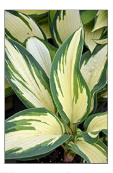
Hans Hosta foliage

This variety produces heart shaped foliage that is corrugated, puckered, and ruffled at the base; the butter-yellow centers changes to white in time, surrounding dark green margins with light green jets; pale lavender flowers in early to mid-summer