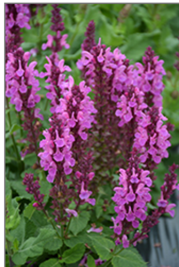
Rose Marvel Meadow Sage flowers

Rose Marvel Meadow Sage is an herbaceous perennial with an upright spreading habit of growth. Its relatively fine texture sets it apart from other garden plants with less refined foliage.