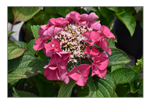
Cherry Explosion Hydrangea flowers