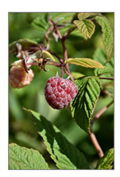
Royalty Raspberry fruit

Royalty Raspberry has rich green deciduous foliage on a plant with an upright spreading habit of growth. The fuzzy oval compound leaves do not develop any appreciable fall colour. It features an abundance of magnificent burgundy berries in mid summer, which fade to deep purple over time.