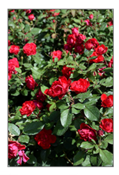
Oso Easy Double Red Rose flowers

This shrub should only be grown in full sunlight. It does best in average to evenly moist conditions, but will not tolerate standing water. It is not particular as to soil type or pH. It is somewhat tolerant of urban pollution. This particular variety is an interspecific hybrid.