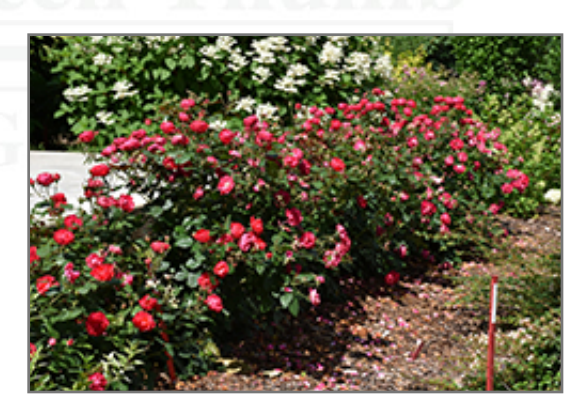
Oso Easy Double Red Rose in bloom