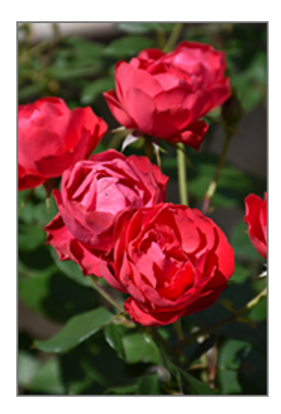
Oso Easy Double Red Rose flowers

This shrub will require occasional maintenance and upkeep, and is best pruned in late winter once the threat of extreme cold has passed. Gardeners should be aware of the following characteristic(s) that may warrant special consideration;