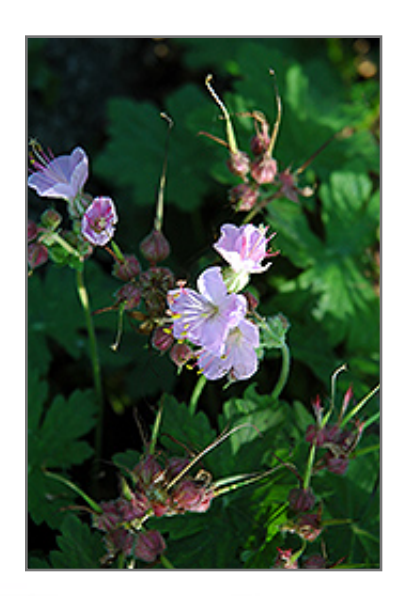
Ingerwesen's Variety Cranesbill flowers

A low growing, mounded selection featuring light pink flowers during the early summer months and highly fragrant green leaves which develop to beautiful reds and oranges in the fall; drought tolerant, excellent for use in borders, beds or as groundcover