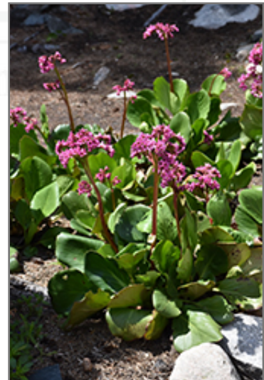
Heartleaf Bergenia in bloom