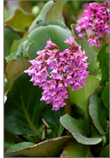
Heartleaf Bergenia flowers

This is a relatively low maintenance plant, and is best cleaned up in early spring before it resumes active growth for the season. Deer don't particularly care for this plant and will usually leave it alone in favor of tastier treats. It has no significant negative characteristics.