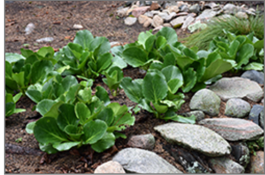
Heartleaf Bergenia

Heartleaf Bergenia will grow to be about 12 inches tall at maturity, with a spread of 18 inches. Its foliage tends to remain dense right to the ground, not requiring facer plants in front. It grows at a medium rate, and under ideal conditions can be expected to live for approximately 10 years. As an evergreen perennial, this plant will typically keep its form and foliage year-round.