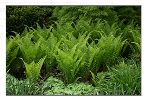
Ostrich Fern