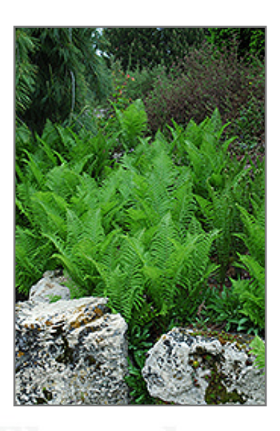
Ostrich Fern