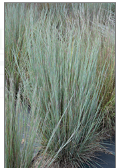
Prairie Blues Bluestem