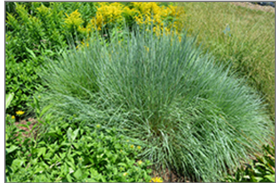
Prairie Blues Bluestem

Prairie Blues Bluestem is recommended for the following landscape applications;