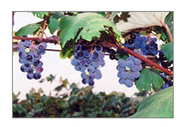
Concord Grape fruit

The best-known commercial variety by far, this vigorous, trailing vine is grown for its large reddish-purple fruit in fall, excellent for eating fresh or in jellies; use as a screen for arbors or winding along fences, requires regular pruning and sun