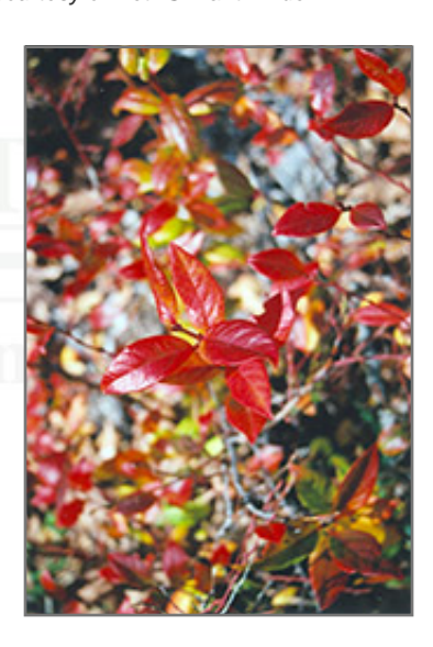
Northsky Blueberry in fall