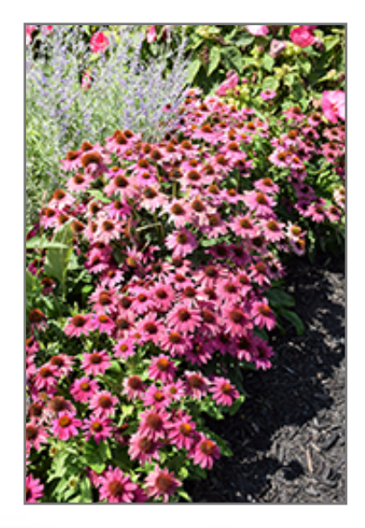
PowWow Wild Berry Coneflower in bloom