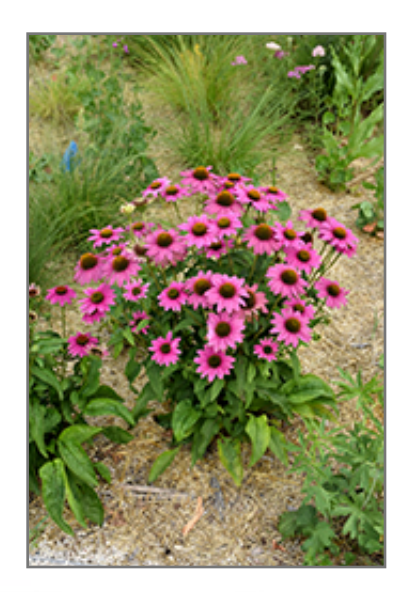
PowWow Wild Berry Coneflower in bloom

PowWow Wild Berry Coneflower is an herbaceous perennial with an upright spreading habit of growth. Its medium texture blends into the garden, but can always be balanced by a couple of finer or coarser plants for an effective composition.