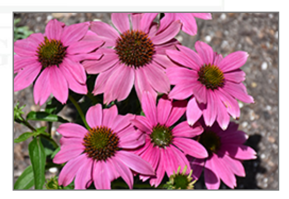
PowWow Wild Berry Coneflower flowers