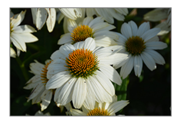
PowWow White Coneflower flowers

PowWow White Coneflower is an herbaceous perennial with an upright spreading habit of growth. Its medium texture blends into the garden, but can always be balanced by a couple of finer or coarser plants for an effective composition.