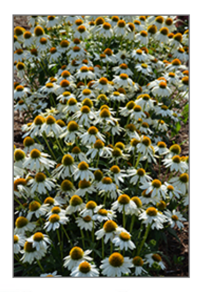
PowWow White Coneflower flowers