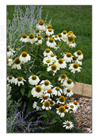
PowWow White Coneflower in bloom