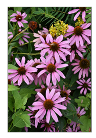
Purple Coneflower flowers

This is a relatively low maintenance plant, and is best cleaned up in early spring before it resumes active growth for the season. It is a good choice for attracting birds and butterflies to your yard, but is not particularly attractive to deer who tend to leave it alone in favor of tastier treats. It has no significant negative characteristics.