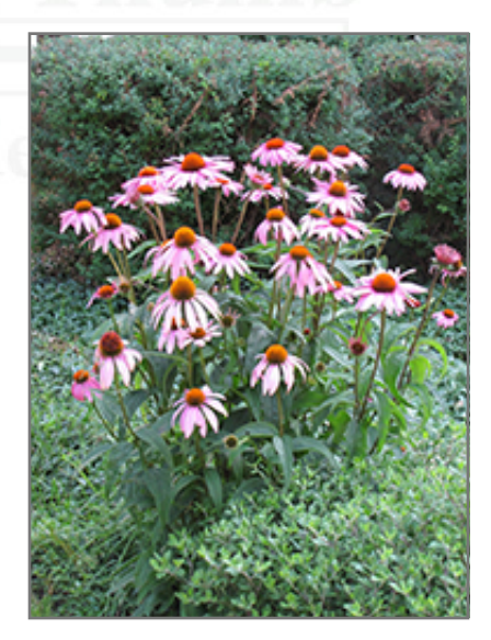
Purple Coneflower in bloom