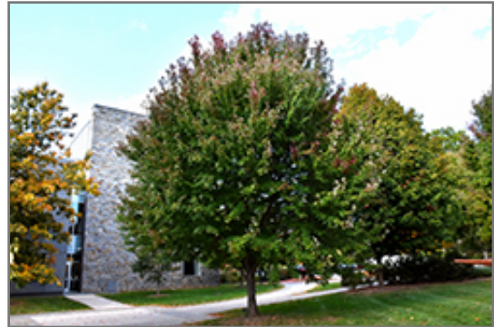
Brandywine Red Maple

This tree does best in full sun to partial shade. It prefers to grow in average to moist conditions, and shouldn't be allowed to dry out. It is not particular as to soil type, but has a definite preference for acidic soils, and is subject to chlorosis (yellowing) of the foliage in alkaline soils. It is somewhat tolerant of urban pollution. This is a selection of a native North American species.