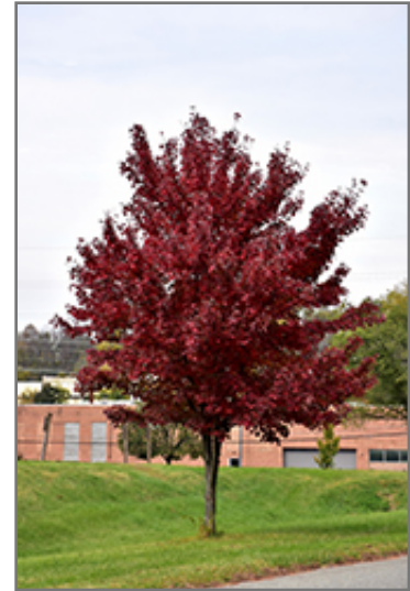
Brandywine Red Maple in fall

Brandywine Red Maple is recommended for the following landscape applications;