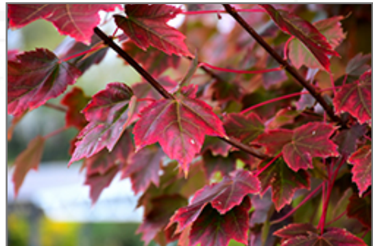
Brandywine Red Maple in fall