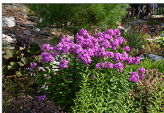
Flame Purple Garden Phlox in bloom