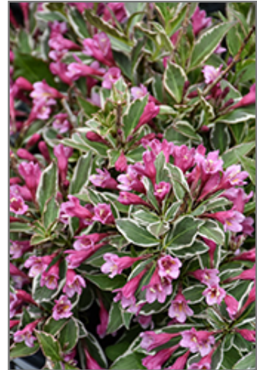
My Monet Purple Effect Weigela flowers

My Monet Purple Effect Weigela makes a fine choice for the outdoor landscape, but it is also well-suited for use in outdoor pots and containers. It can be used either as 'filler' or as a 'thriller' in the 'spiller-thriller-filler' container combination, depending on the height and form of the other plants used in the container planting. It is even sizeable enough that it can be grown alone in a suitable container. Note that when grown in a container, it may not perform exactly as indicated on the tag - this is to be expected. Also note that when growing plants in outdoor containers and baskets, they may require more frequent waterings than they would in the yard or garden. Be aware that in our climate, most plants cannot be expected to survive the winter if left in containers outdoors, and this plant is no exception. Contact our experts for more information on how to protect it over the winter months.