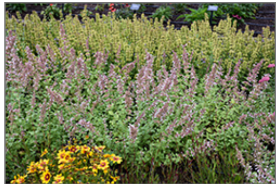
Whispurr Pink Catmint in bloom