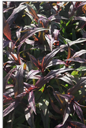
Pocahontas Beard Tongue foliage