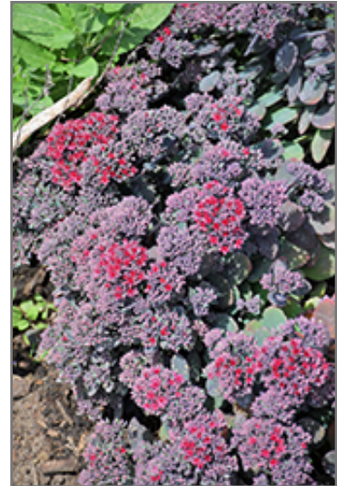
Rock 'N Grow Superstar Stonecrop flower buds

Rock 'N Grow Superstar Stonecrop is recommended for the following landscape applications;