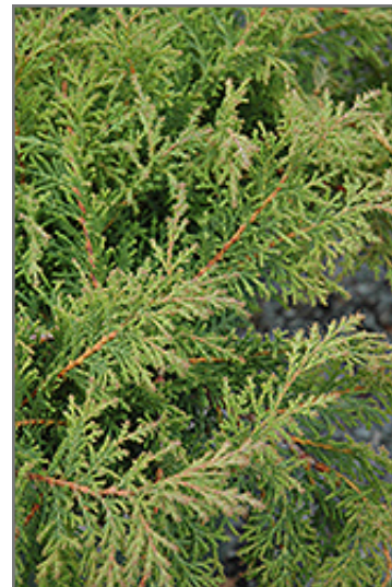
Fuzzball Siberian Carpet Cypress foliage