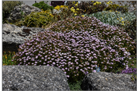
Pink Ice Candytuft in bloom

This plant does best in full sun to partial shade. It is very adaptable to both dry and moist growing conditions, but will not tolerate any standing water. It is not particular as to soil type or pH. It is highly tolerant of urban pollution and will even thrive in inner city environments. This particular variety is an interspecific hybrid.