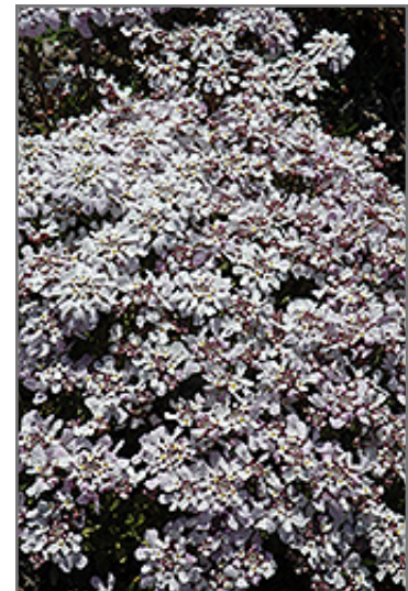
Pink Ice Candytuft flowers